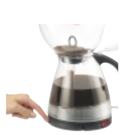
14. A funnel holder is integrated in the power base. Press lightly on the swing.